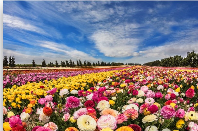
A field of buttercups at a cut flower farm outside of Nir Yitzchak, a kibbutz in the northwestern Negev Desert of Israel

T his is another promise from Isaiah about Israel's restoration, but this one specifically mentions that the desert will blossom. It could be read in a metaphorical way, but God, in his abundant faithfulness, has gone the extra mile and literally caused the deserts of Israel to blossom with roses, tulips, and lilies as far as the eye can see. The photo pictured here is from a commercial cut flower farm located in the Negev Desert. Millions of flowers bloom here every year and the majority are exported for sale in Europe. Other floriculture farms are budding all across Israel from north to south and, interestingly enough, most of them are found in regions of the country that were previously the most deserted and desolate. Today, the country grows an estimated 1 billion flowers every year and exports a large percentage of them, earning Israel a spot as one of the largest exporters providing flowers to Europe and one of the top ten flower-producing countries worldwide. 19 The deserts of Israel are literally blossoming and their beauty is being shared all around the world.