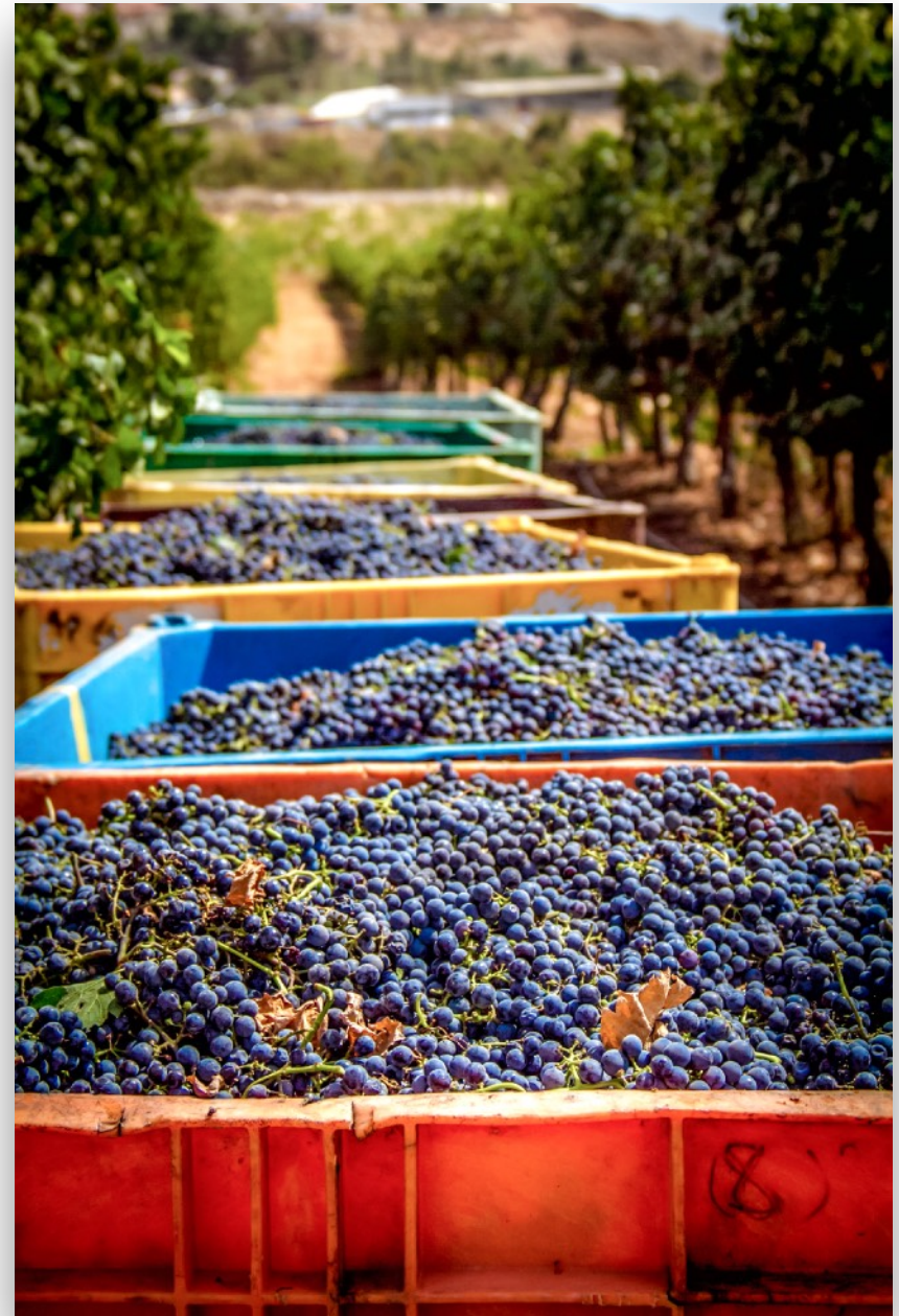
Harvested grapes in the field awaiting transport to the winery

If this story had happened in France or California, we would call it an unexpected bumper crop. But for it to happen on the mountains of Israel, exactly as the Bible said would happen, with grapevines that soil scientists said would never grow? We call this prophecy fulfilled!