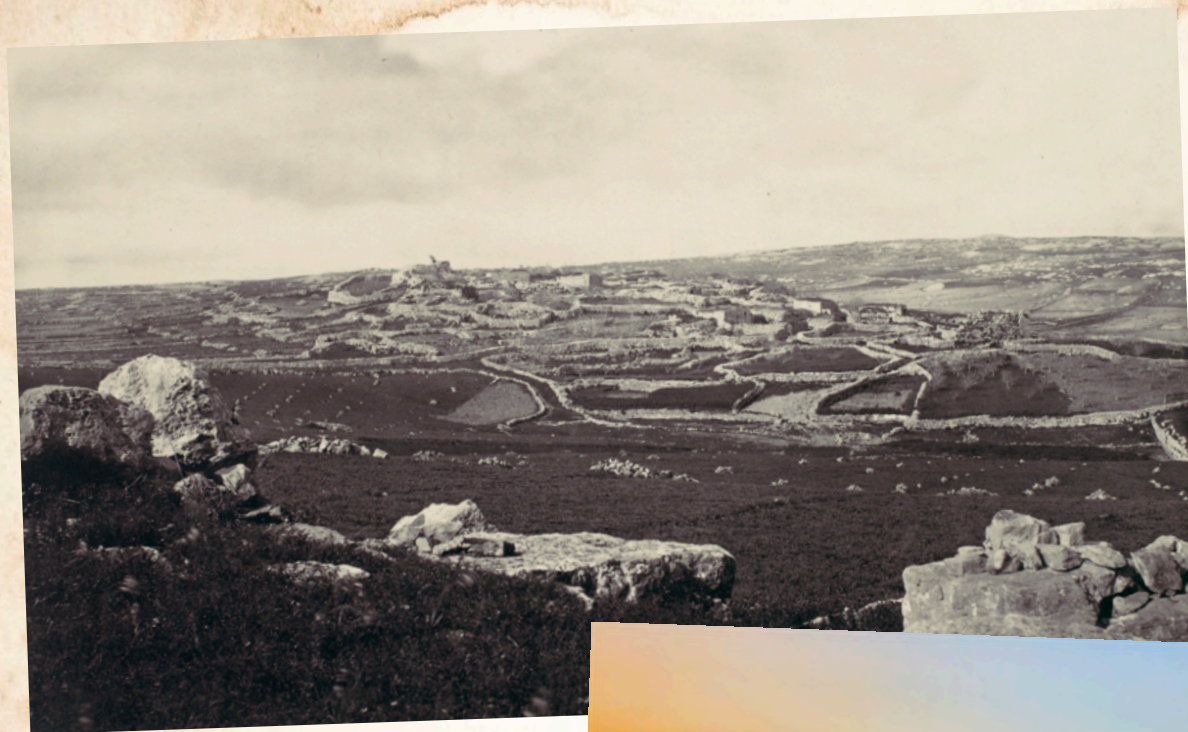
Bethel in the 1890s