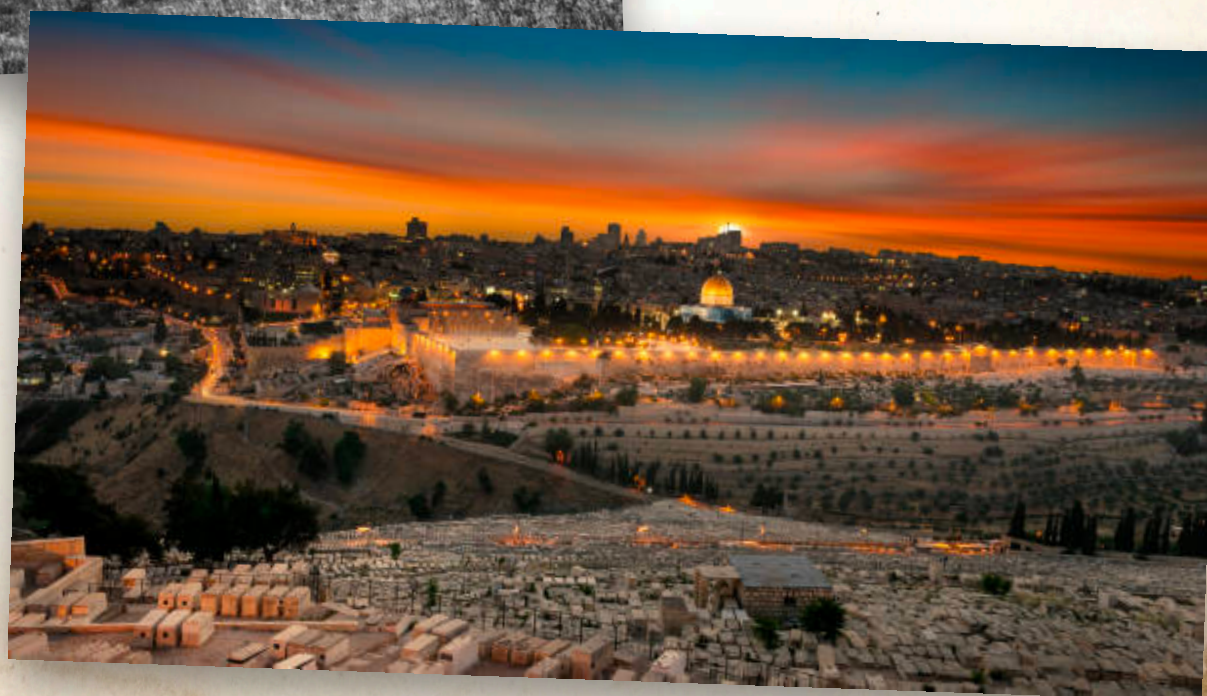
Jerusalem in May 2022