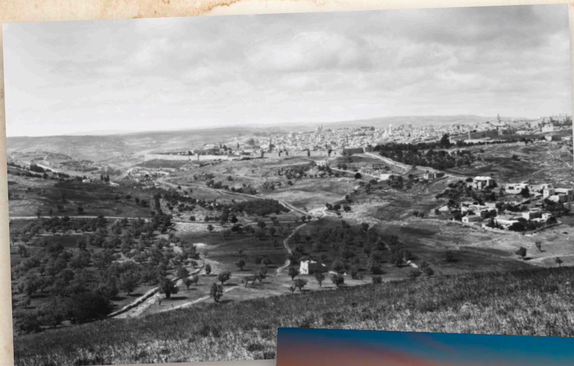
Jerusalem in May 1936