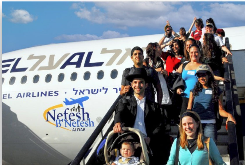
Hundreds of Jewish people are immigrating to Israel every week

The miracle of this prophecy in Deuteronomy, however, is not found in the annals of history; it's happening today, right now, as you are reading this booklet. Every year, thousands of Jewish people immigrate to Israel from over 105 countries around the world. In 2025, Israel welcomed home over 22,000 Jewish people from around the world who chose to leave behind their current life and start a new one in the land of Israel. 6 That means, on average, more than 60 people are being gathered every single day from the farthest parts of the earth and brought home to the land of their ancestors. Talk about prophecy fulfilled!