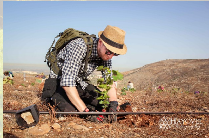
A Christian volunteer from Sweden helping a Jewish farmer plant new crops