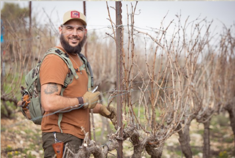
A Christian volunteer from the United States helping prune grapevines on a Jewish farm in Samaria