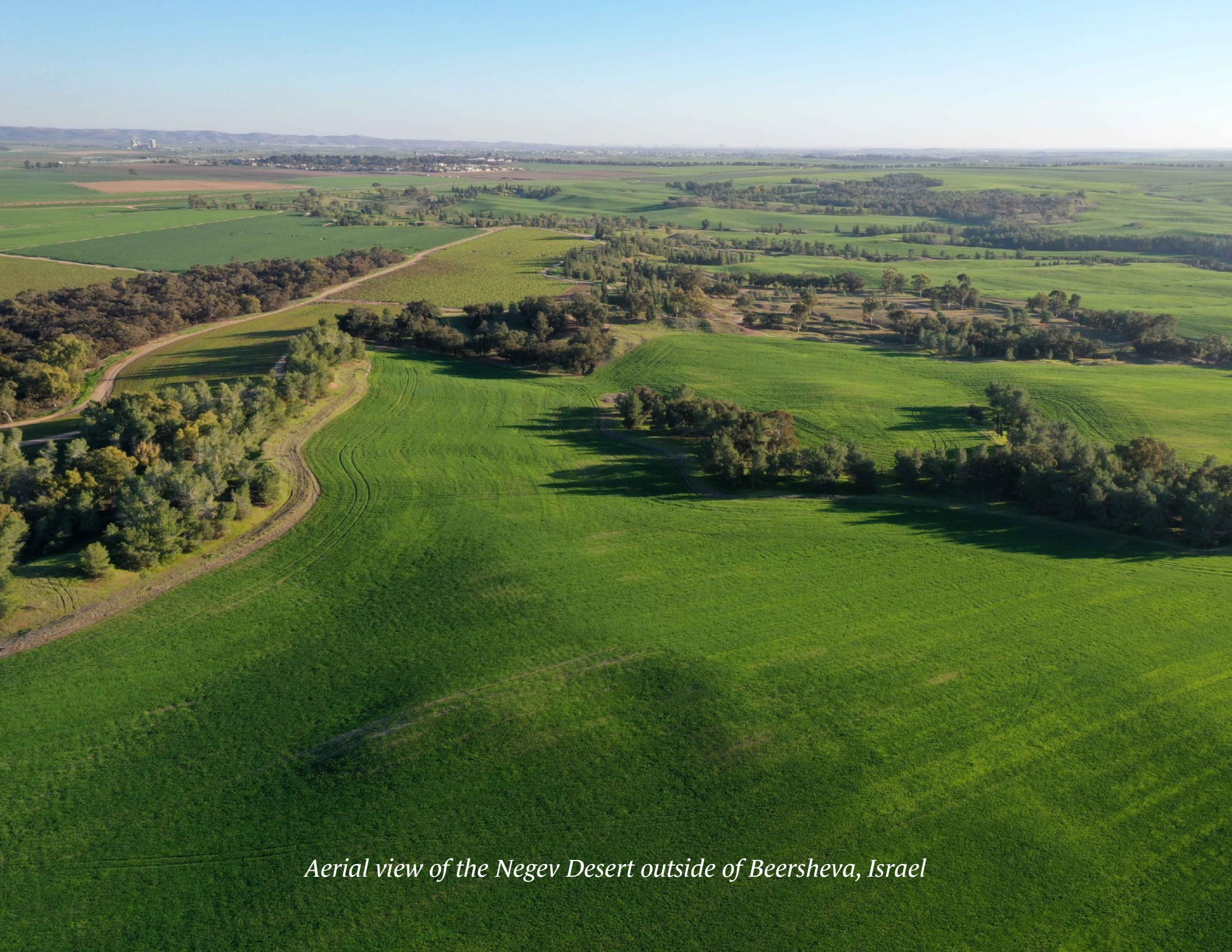
Aerial view of the Negev Desert outside of Beersheva, Israel