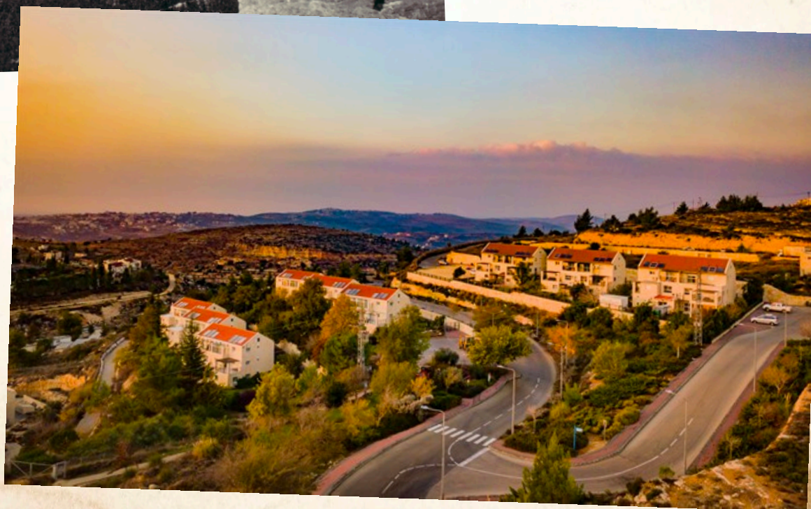
Bethel in November 2019